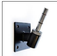
F - WALL BRACKETS 30°

A & B - CROSS BASE CHROME - These heavy duty chrome plated steel bases fold up small for convenience. (A) features ball bearings while (B) features a brass insert Both (A) and (B) enable the flag to move 360 degrees.