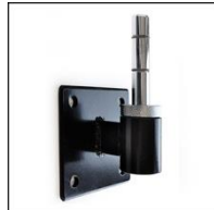
F - WALL BRACKETS 0°