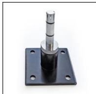
F - WALL BRACKETS 90°