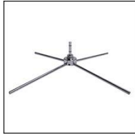
A & B - CROSS BASE CHROME