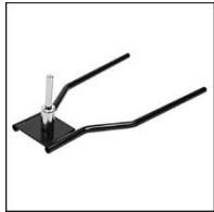
G - TIRE BASE