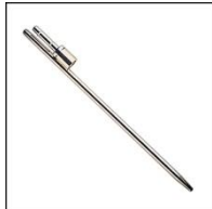
E - SPIKE BASE