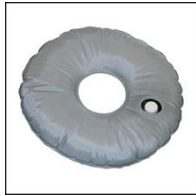
D - WATER BAG